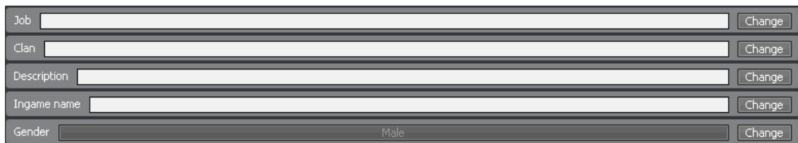
In-game view of the Character info screen under the F1 menu.

Let's start with making your character. Creating and developing your roleplay character is very important. Try to make your character original. To start editing it to your likings, go to the 'Character' tab. You will see some blank fields there that you can fill in. The following are the most important fields to fill in: